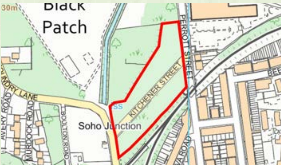
*Boundary is indicative and for illustrative purposes only. Not to scale